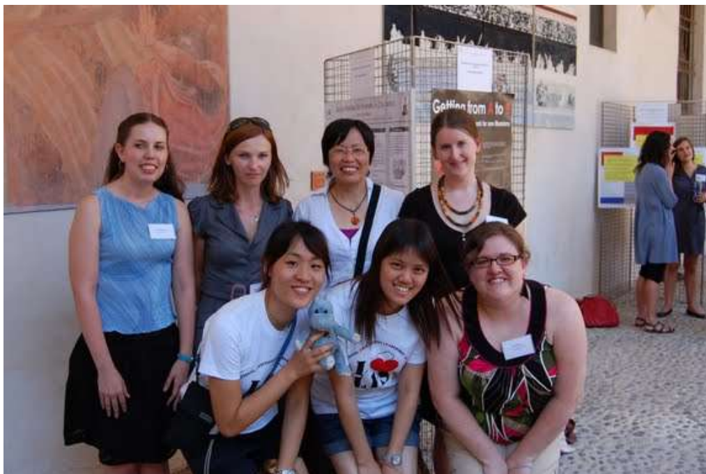
Proud presenters take a break after finishing putting up their displays