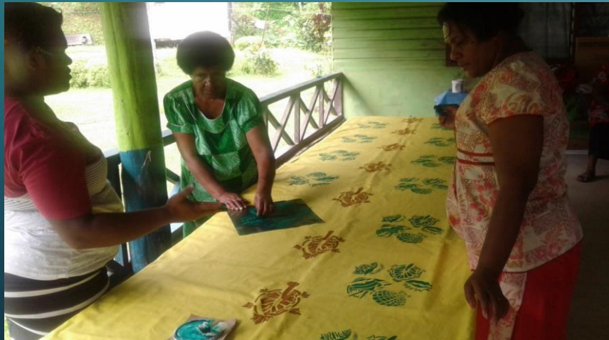
Tie dyeing for women