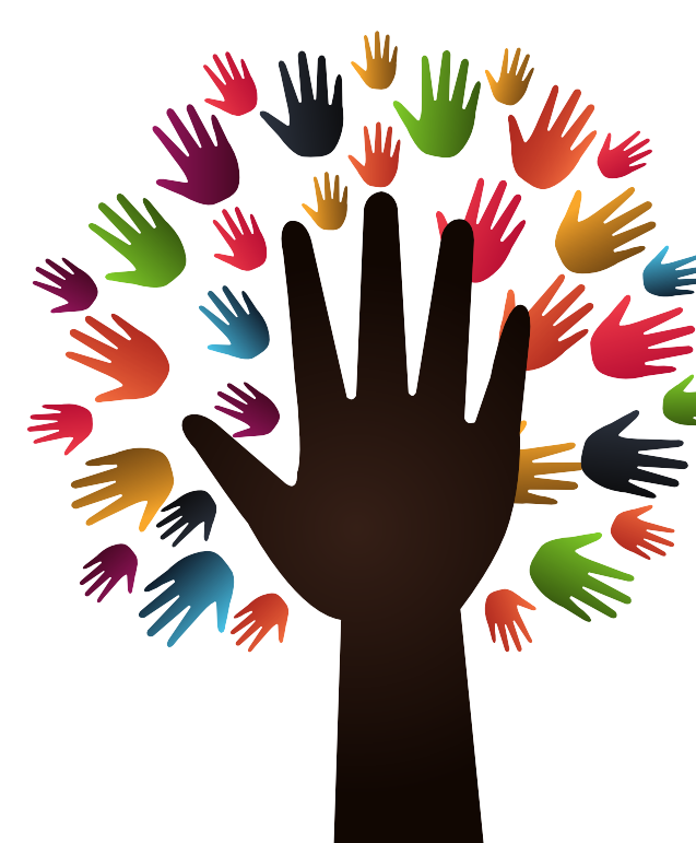
Spring & Summer School