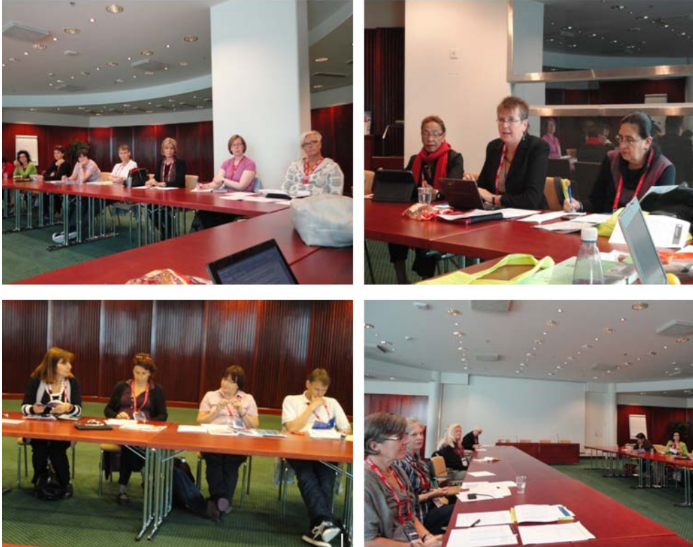
First Standing Committee Meeting

The two Standing Committee Meeting in Helsinki took place on Saturday 8/11 @ 12:30-15:00 Room 208, and Tuesday 8/14 @ 9:45-11:15 Room 208 The Meeting minutes of CPDWL section in Helsinki, Finland are now available on our Section's website .