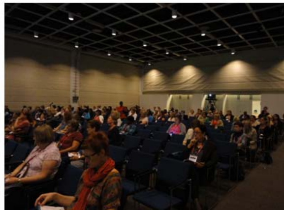
The CPDWL session attracted a very large crowd