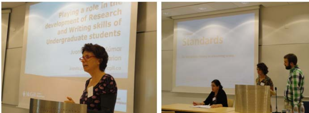
Moderators introducing the presentations

The rest of the program of the two days was divided in seven sessions, with a total of 37 papers and 6 workshops.