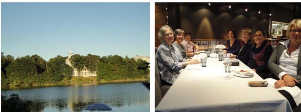
Standing Committee Dinner, next to a Helsinki Lake