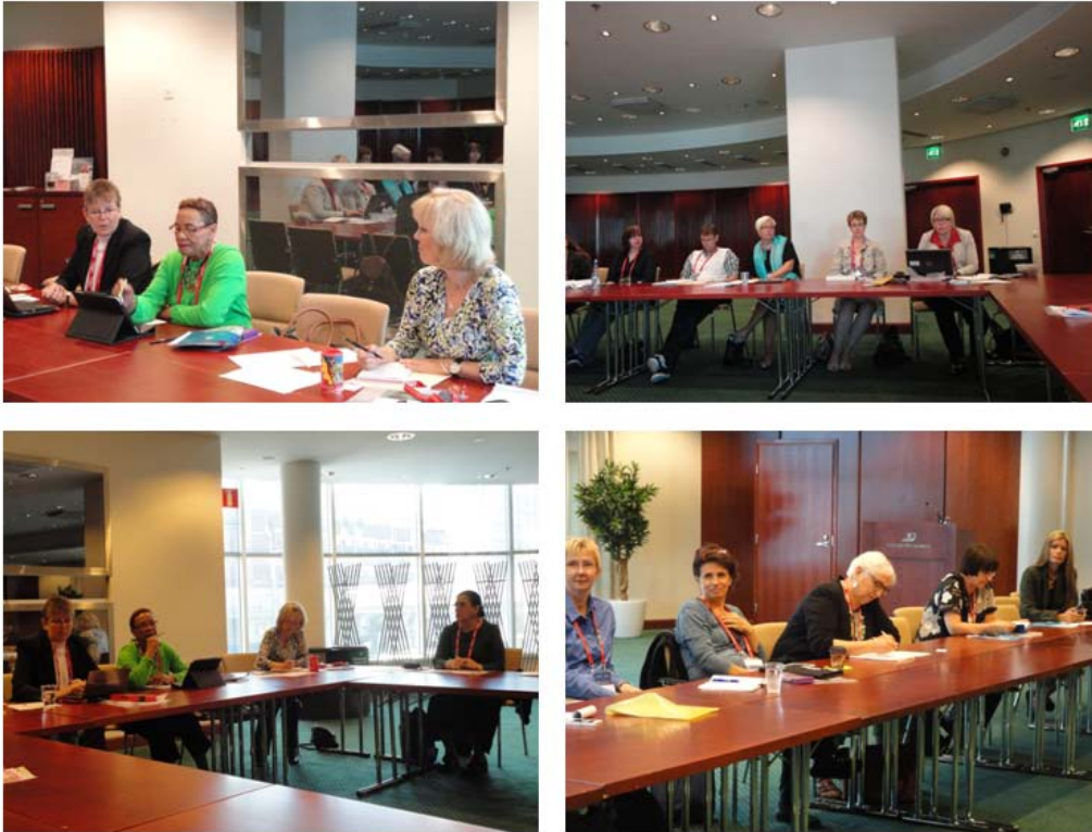
Second Standing Committee Meeting