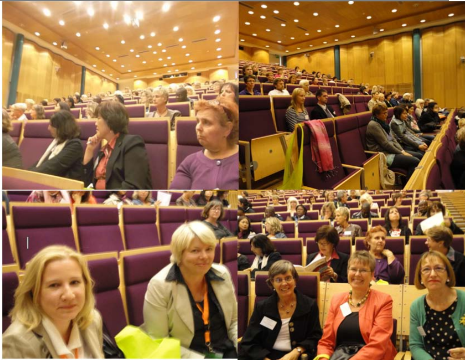
Waiting for the official opening of the Satellite meeting

The rest of the program of the two days was divided in seven sessions, with a total of 37 papers and 6 workshops.