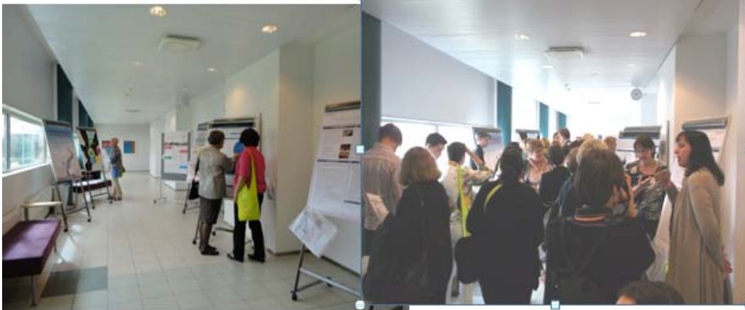
Poster sessions were very well visited

There were also 6 poster sessions on display.