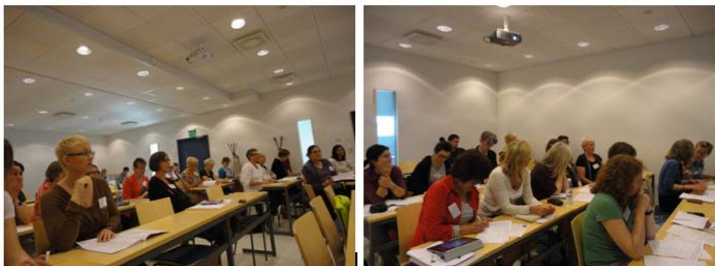
Attending presentations and participating in workshops