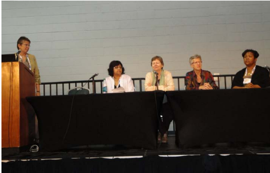
Moderator and presenters in the Thursday session