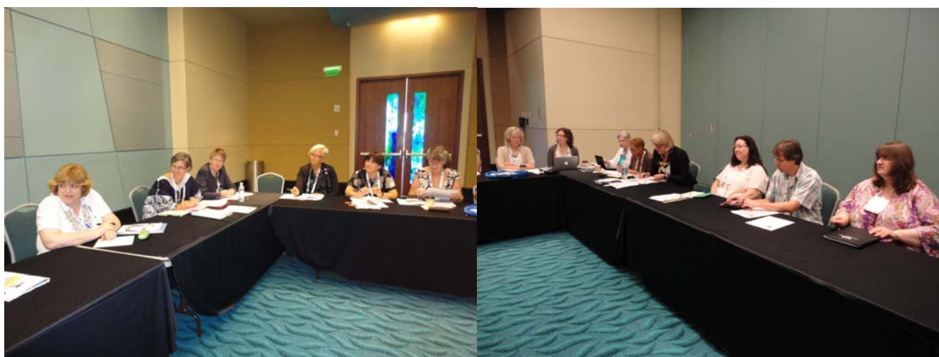
The Standing Committee hard at work during our first meeting