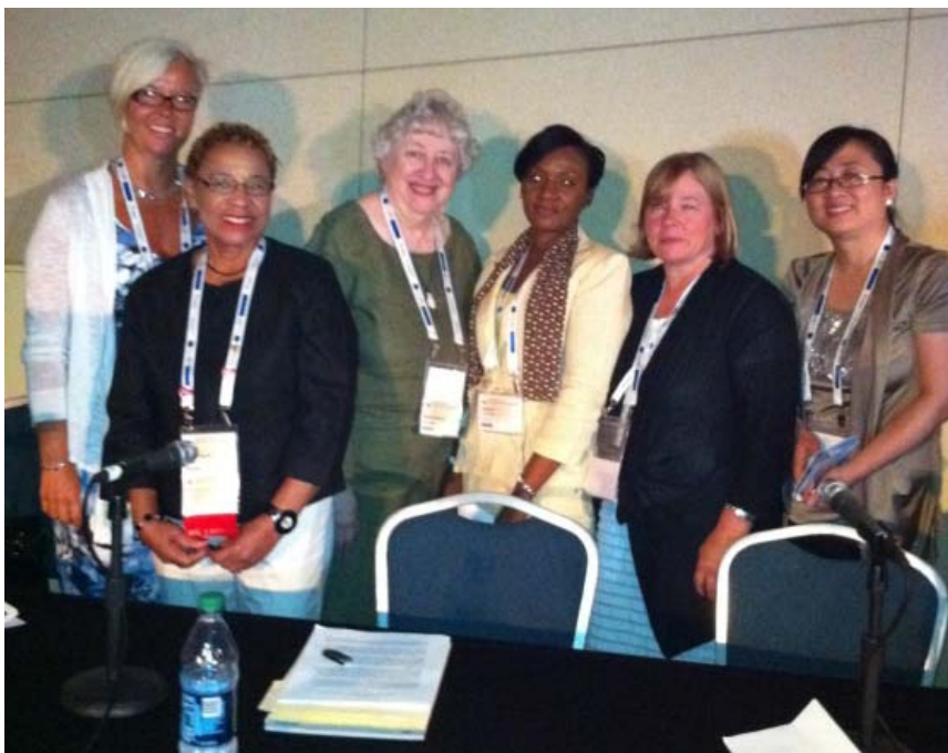
Moderator and presenters in the Tuesday session

There was a good discussion at the end of the formal presentations with audience members sharing their ideas and thoughts.