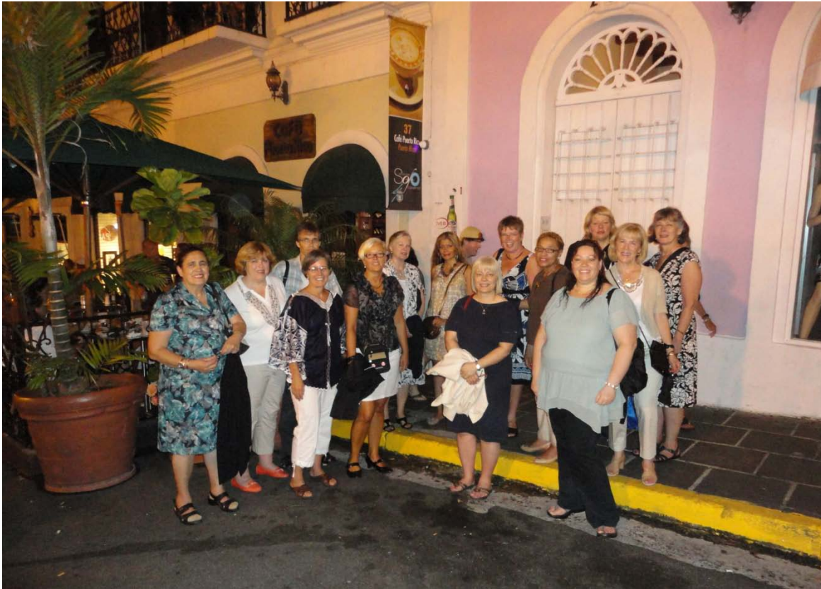
Another successful social evening for the members of the CPDWL Standing Committee