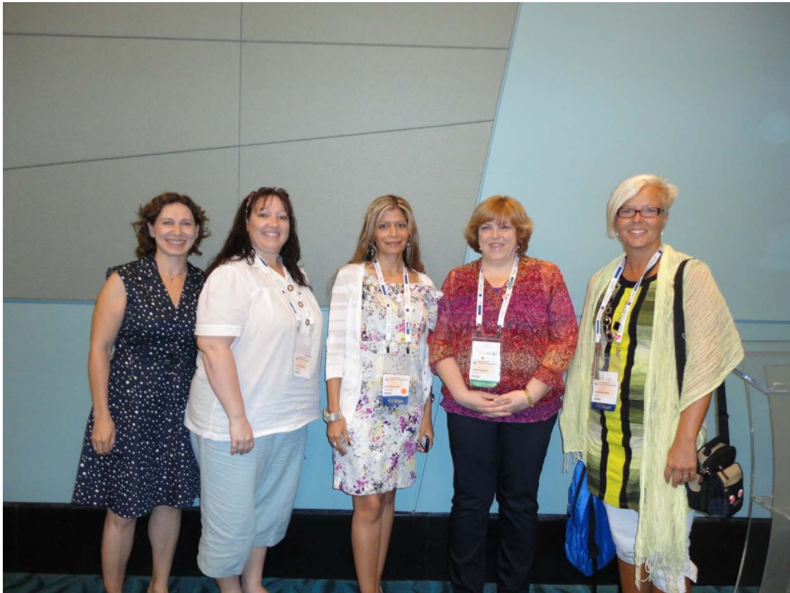
Newly elected Standing Committee members for 2011-2015