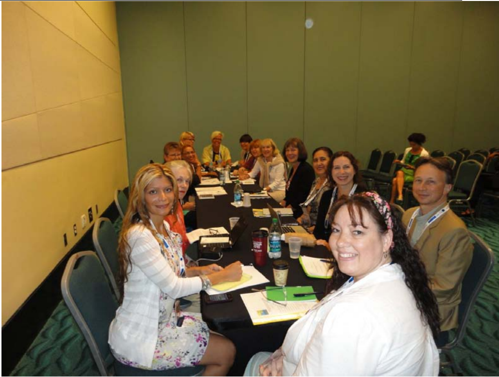
Reviewing our activities and preparing for Finland during our second session