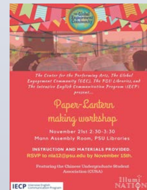
Image Credits: • Photos and DocuNight promotional materials provided by PSU Libraries • Paper Lantern, Book Club, and "Finding Farideh" discussion flyers provided by Penn State Global Engagement Community