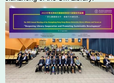
The Forum on "Deepening Library Cooperation and Promoting sustainable Development"