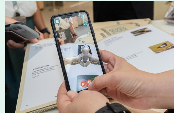
Launch of AR Books, August 2022

The library will continue its effort in bringing content and programmes to our visitors, to raise awareness on sustainability and reimagining learning experience to make content accessible to all.