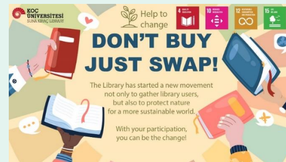
Suna Kiraç Library Book Swap Poster

icons in our poster. Thus, we informed those participating in the Book Swap how they can support the environment and ensure sustainability.