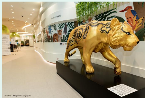
Donation of statue Tribal Gold to Choa Chu Kang Public Library, from World Wide Fund (WWF), August 2022