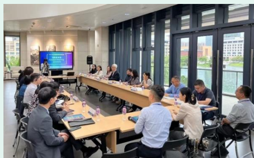
The Council Meeting 2023 of the Guangdong-Hong Kong-Macau University Library Alliance

The Council Meeting of the Library Alliance was held on 19 April 2023 in the University Gallery of UM. Academic libraries from the 3 regions reported on their recent, local collaboration projects and exchanged ideas for future development. Further cooperation was suggested by forming working groups on themes including training for young librarians, Chinese name authority related to the Guangdong area, and a library staff exchange programme.