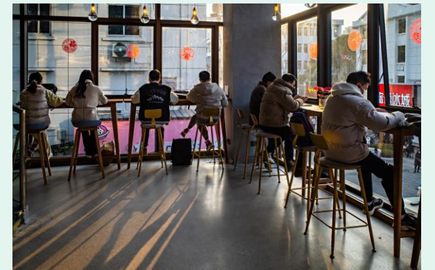
Reading Area for Landscape by Windows