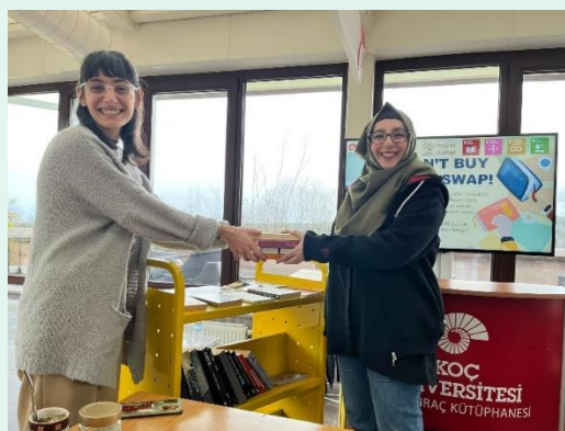
11 Swapping books at Trade Fair

We also participated in the "Trade Fair Event" held at the Koç University's main campus with Suna Kiraç Library Book Swap stand. One of the first things that comes to mind regarding book swaps is ensuring the process to exchange the books is simple. Since consumption habits are one of the most critical behaviors that need attention and change for a more sustainable and green future, our aim while planning the book swap was to draw attention to responsible consumption.