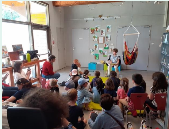
Story time with the winner of the "Petits champions de la lecture" competition