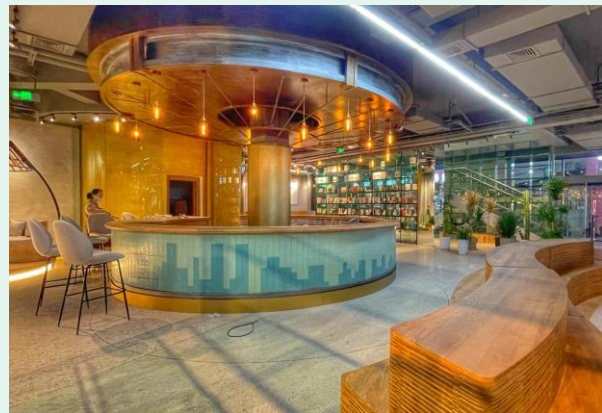
Water bar and Dessert Workshop

Fine out more about the library in this promotional video .