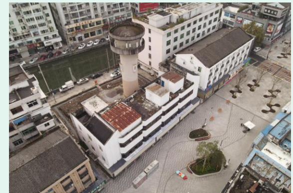
The Original Water Tower

The city's "Water Tower" Library is not merely a renovation of Longgang's old water factory. It is also an exemplary instance of repurposing abandoned buildings by revitalizing them and maximizing their environmental and sustainable potential.