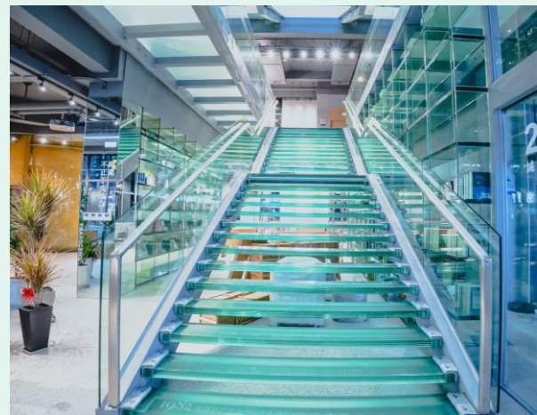
Glass Stairs which Marked with Big Events of Longgang City

The transformation of historic buildings can be seen as a way to protect city history. The "Water Tower" Library serves as a carrier of memorable heritage of the city by integrating the development history of Longgang city into the building. On the beautiful glass stairs in the library, every two of them are marked with big events promoting the development of this city. Therefore, each and every visitor to the library could have a general idea of the reform and development process and cultural spirit of Longgang.