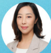
Carmen Lei Episode 3 (in Chinese) Macau, China