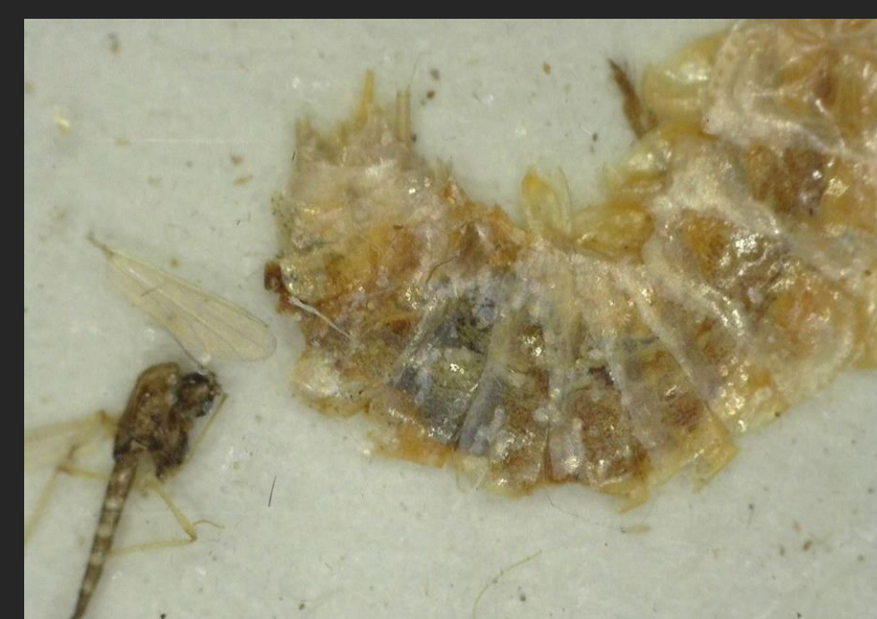
Fig. 8. Insects under the microscope