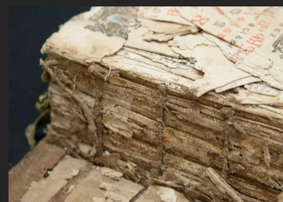
Fig. 3. Close photo of severe book damages