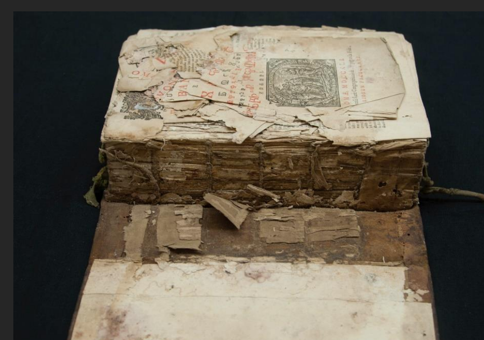
Fig. 2. Example of a severe damaged book