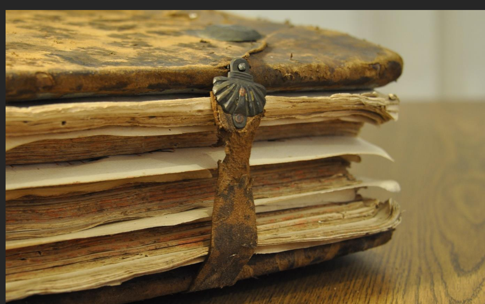
Fig. 1. Detail of book damages

Education, starting primary with librarians, but other staff where necessary, is a goal in National and University library, since years of working have showed that more books deteriorate than can be saved. Often uneducated librarians cause even more damage to the books with wrong handling or writing and putting notes inside the books with water soluble ink. Such mistakes are very often and need to be pointed out to raise awareness.