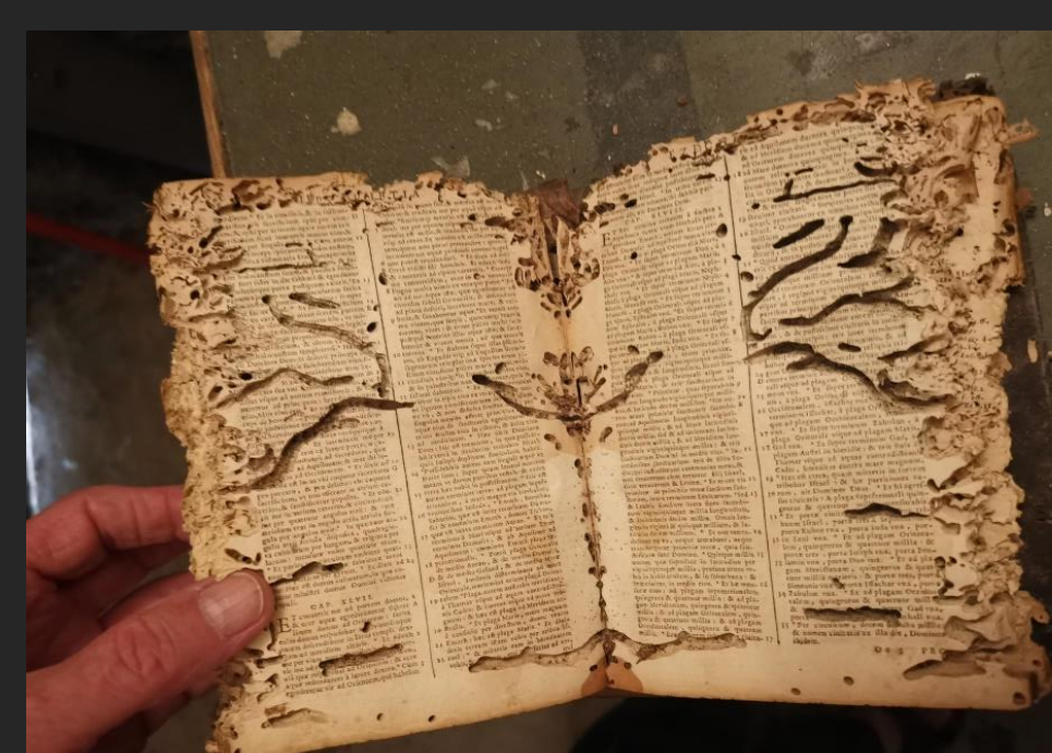
Fig. 5. Insect damages on the inside of the book