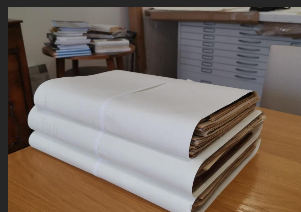
Fig. 6. Books wrapped in pH neutral paper