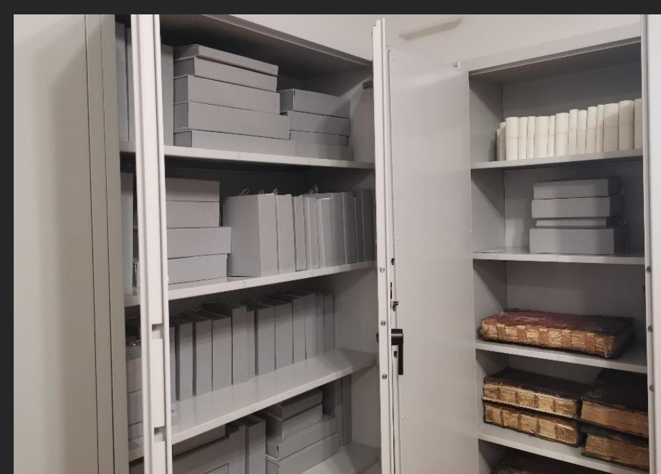
Fig. 9. Books stored in a safe cabinet