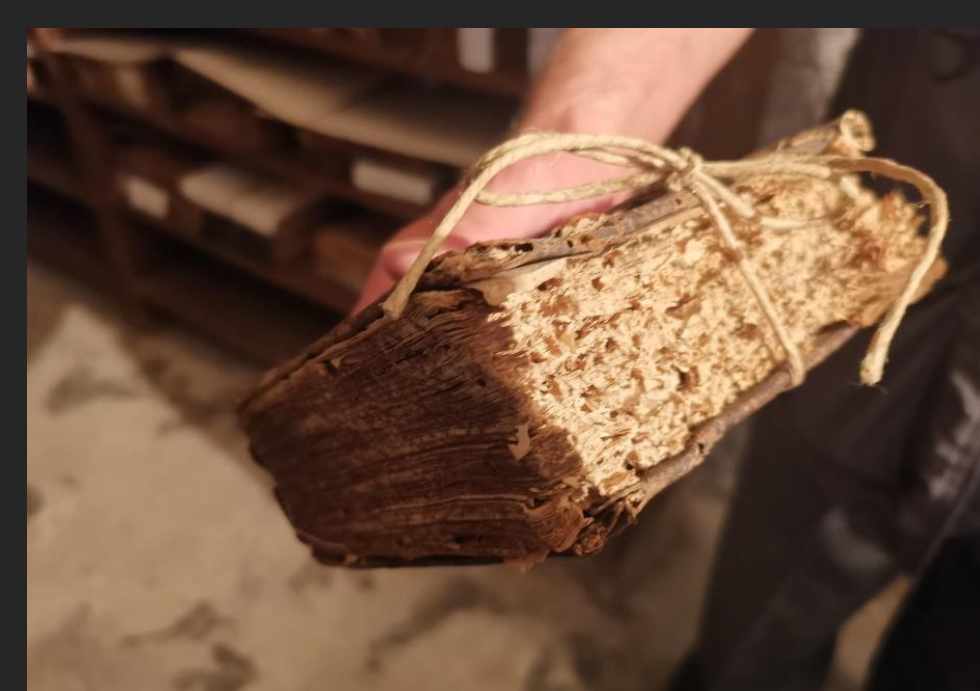
Fig. 4. Insect damages on the outside of the book