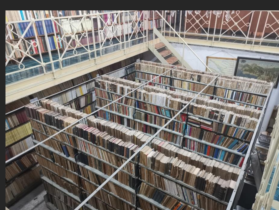
Fig. 11. Properly arranged books