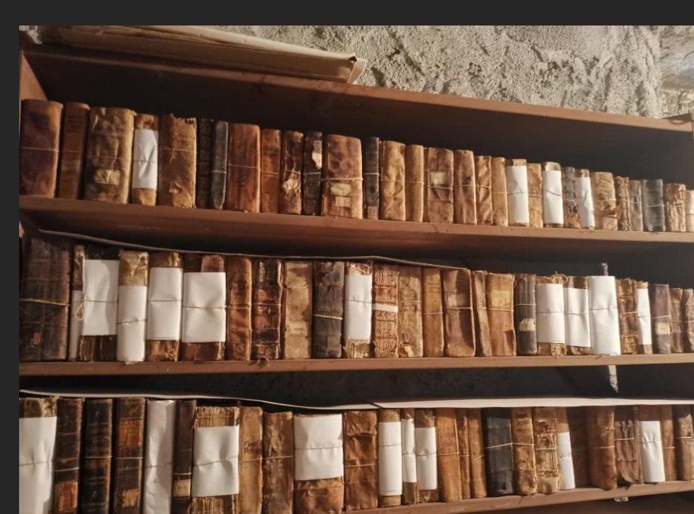
Fig. 10. Improperly arranged books