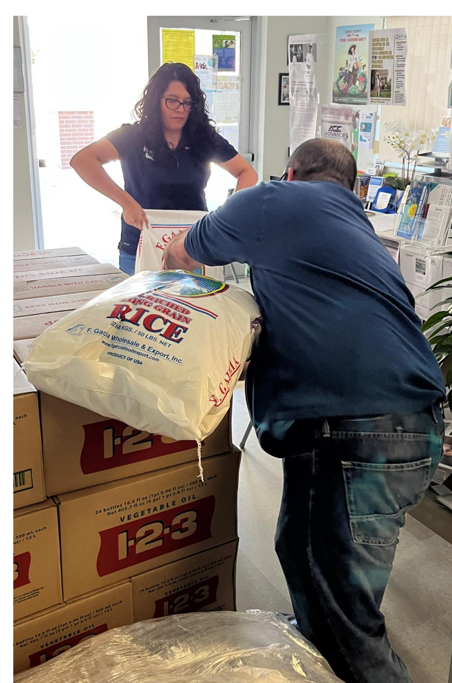
Distribution of essential food following Hurricane Ian