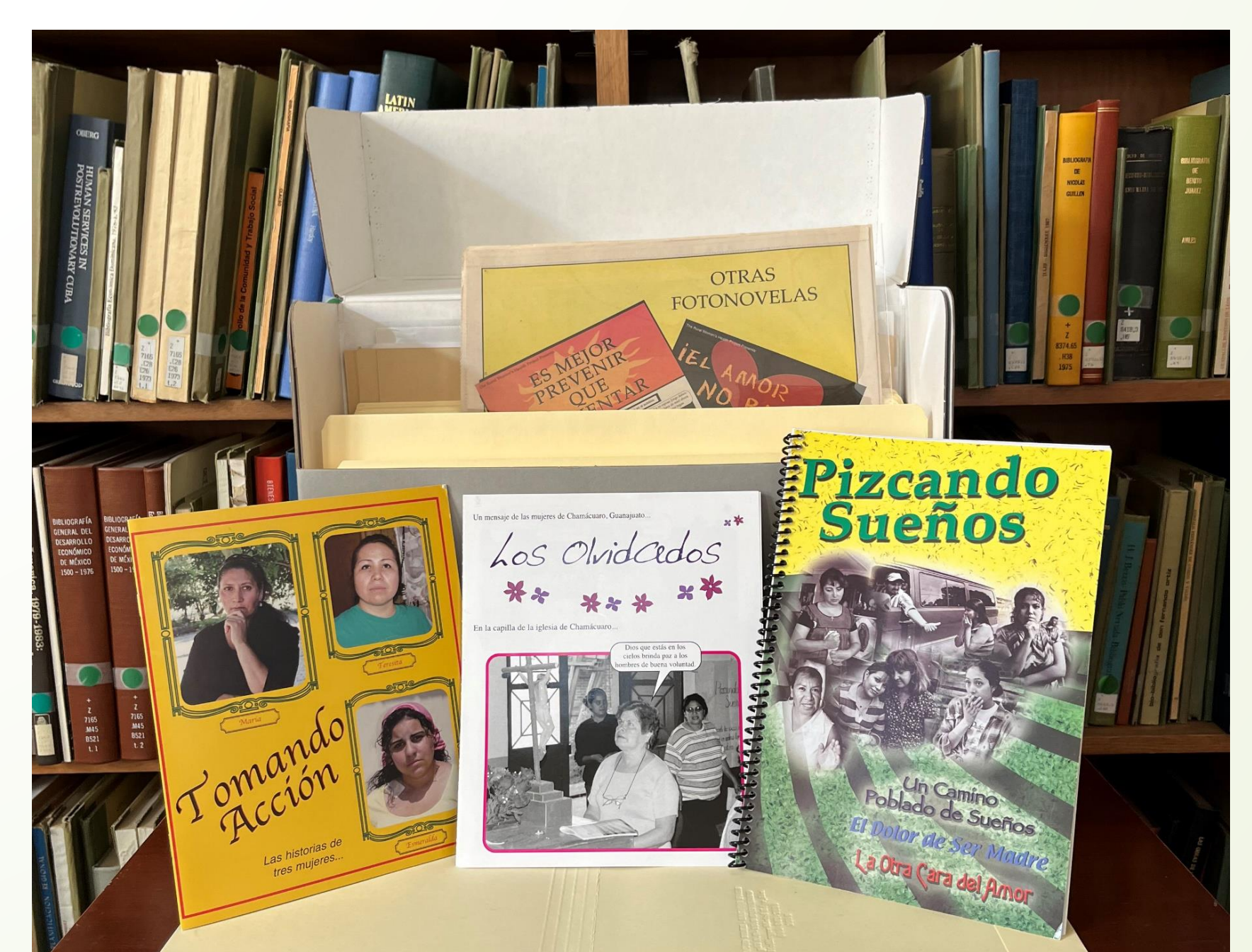
Fotonovelas from the Rural Womens Health Project donated to the UF Libraries

In year two, this project will focus on farmworker support organizations in south Florida.