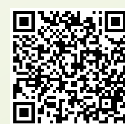
Project background and current status from Hidden Histories podcast 3/7/2023

Training materials from lessons learned are being developed to encourage national replicability.