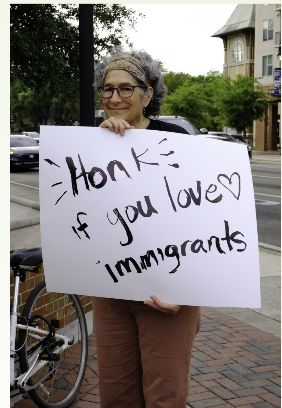
Garnering public support for immigrants

COVID's impact on Florida farmworkers made it clear that farmworkers are essential, but their experiences are hidden.