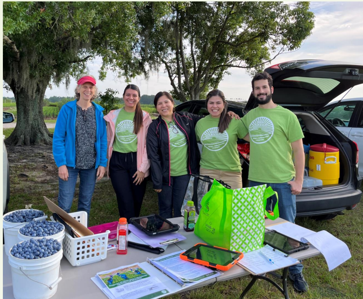
Distribution of federal COVID relief funds to farmworkers with the Rural Women's Health Project

This project helps build a sustainable future where academic libraries are engaged with their communities, highlighting stories of minoritized, misunderstood, and misrepresented people.