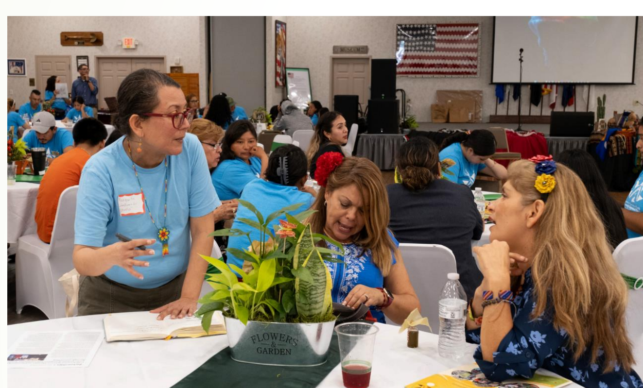
Celebrating 40 years of the Farmworker Association of Florida

Two academic libraries and two Florida farmworker community-based organizations are collaborating to design an archival plan to preserve and make accessible their work and impact.