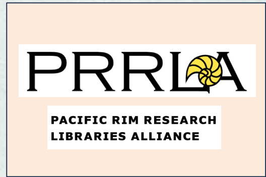
Pacific Rim Research Libraries Alliance (PRRLA) Sharing Session