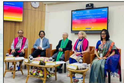
Empowering Youth through Media and Information Literacy: Aligning Global Media and Information Literacy Week Celebration with the UN SDGs