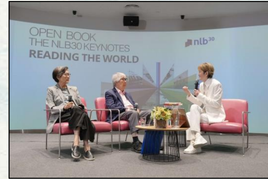
Open Book: The NLB30 Keynotes Series Explores the Future of Reading and Learning