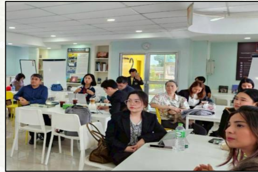
Thai Library Association Fosters Strong Partnerships Among Librarians to Achieve SDGs Through Community-Focused Services