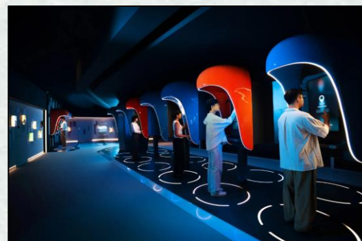
SG60 Heart&Soul Experience: How do you show the future to a nation when everyone has their own hopes and dreams?