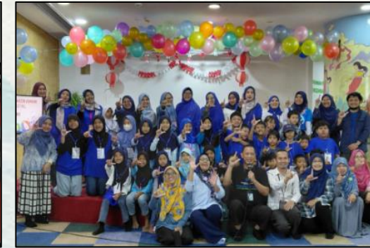
Seeds of Literacy: How KELANA Nurtures Children's Learning and Supports SDG4