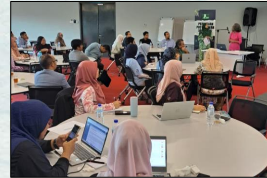
From Book Stacks to Strategic Development Hubs: Learning Together to Create Impact Outcomes