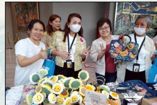
Continuing & Sustainable Learning Centre in Thailand: Relearning Space @Library