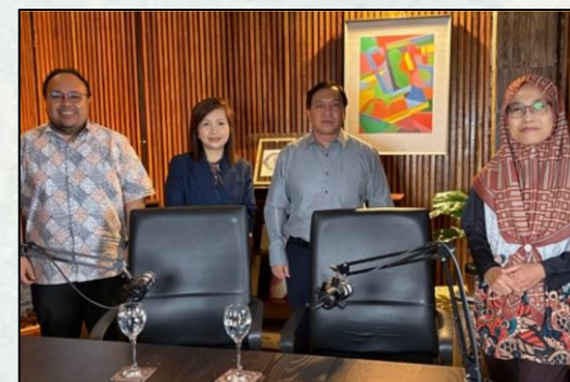
Empowering Open Science Across Borders: Stories from NTU Librarians