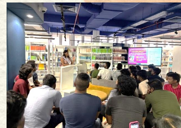
Celebrating Sheroes - Women who break barriers and lead change