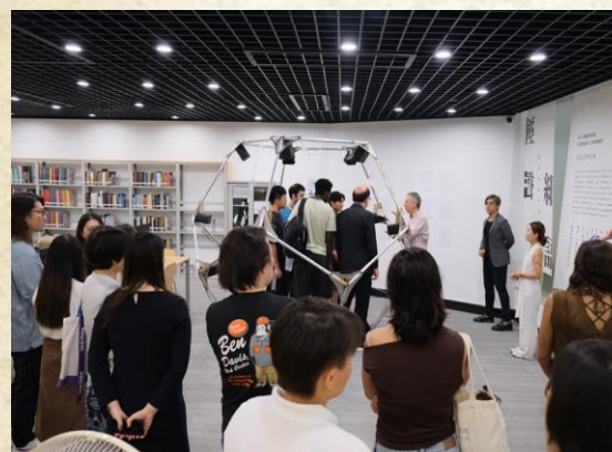
WHISPER: Joint Reading Through "Reading on Air"