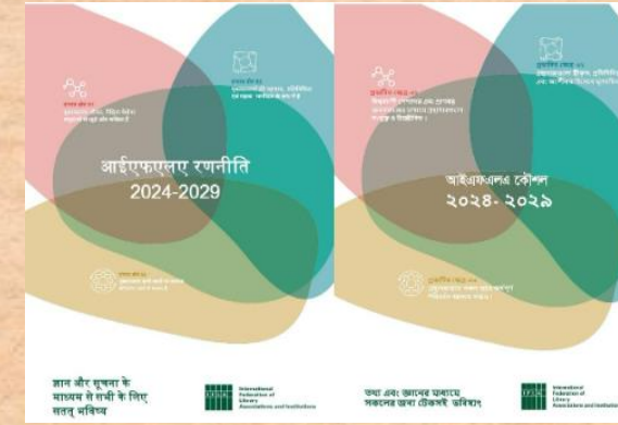
IFLA Strategy 2024-2029 Designed to support reflection and planning at regional and national level is now available in Hindi and Bengali