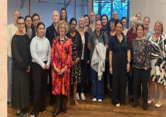
IFLA Impact Training: Measurement, Evaluation and Demonstrating Impact