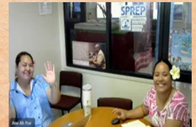
Tuvalu strengthens capacity in environmental knowledge management