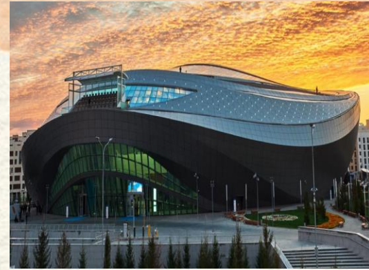
IFLA World Library and Information Congress 2025