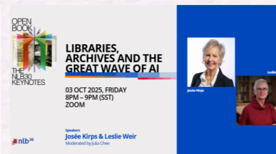
Discover How Libraries and Archives Can Ride the Great Wave of AI at the NLB30 Keynotes