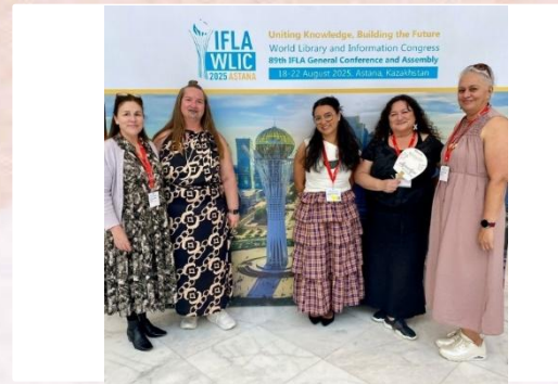
Reflections from World Library and Information Congress by First-Time Attendee