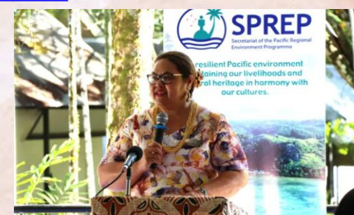
SPREP launches Anamua: Treasures of the Pacific Environment