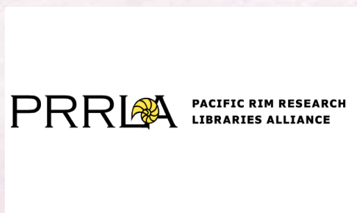
PRPLA 2025 Karl Lo Awardees