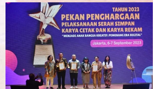
Preserving Heritage: Implementation of Legal Deposit at NLI