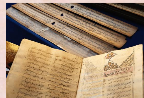
Bringing Indonesia's Manuscript Heritage to the Global Stage