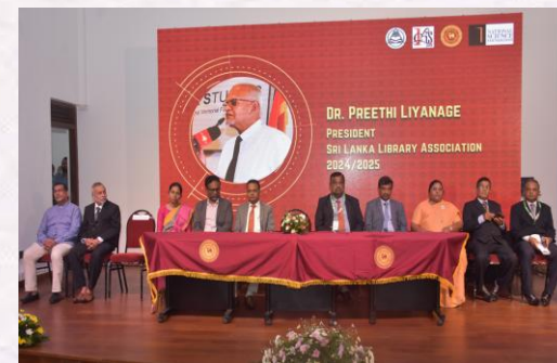
Learning Beyond Borders: Reflections from Nepal's Participation in ICLIS25