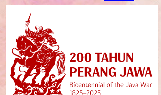
Honoring 200 Years of the Java War: Preserving Prince Diponegoro's Legacy in the Digital Age through NLI's Commitment to SDG 11