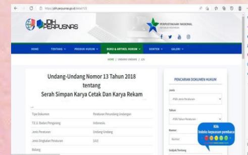
Legal Deposit and Its Contribution to The Sustainable Development Goals