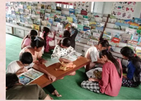
The Power of a Library: How Jhuwani's Lifeline Transformed a Village Across Generations