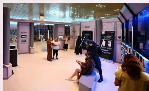
NLB brings to life Singapore's first Star Wars Pop-Up Library