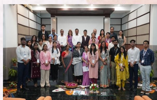
Symposium on "Libraries Bridging the Digital Divide: Empowering Communities through Digital Literacy"