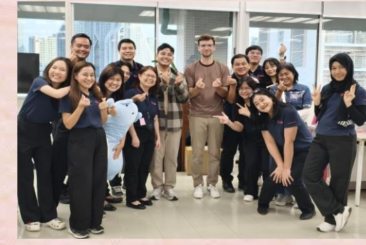
The Chula-Global Library Visiting Fellowship Program: A Contribution to AI Literacy in Southeast Asia