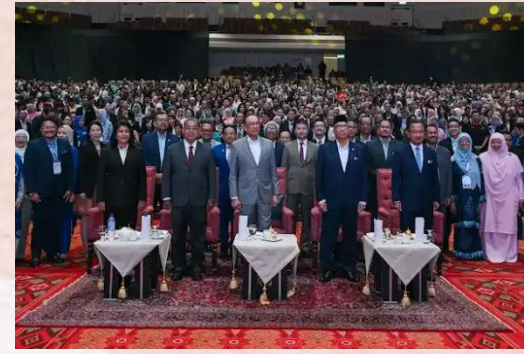
Southeast Asia's Library Community Unites at CONSAL XIX in Kuala Lumpur