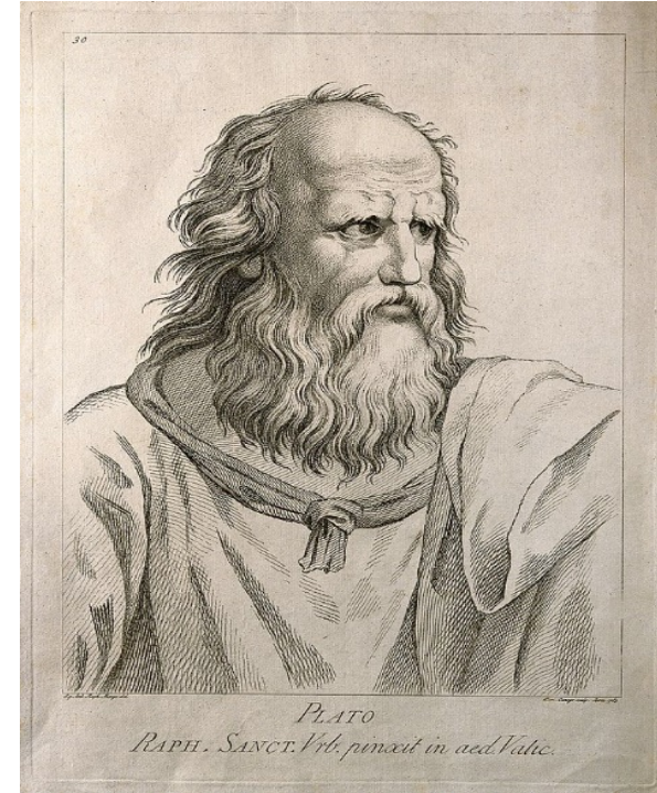
Plato. Etching by D. Cunego, 1783, after R. Mengs after Raph Creative Commons Attribution only licence CC BY 4.0. Wellcome Library, London.