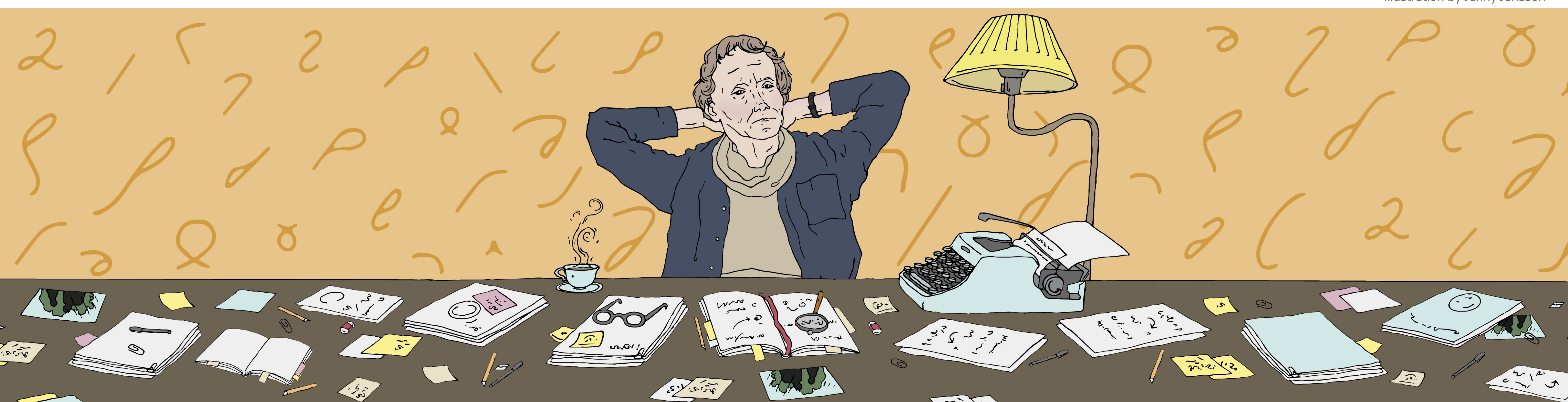
Illustration by Jenny Jansson

Shorthand: a writing method to take notes quickly ("to catch the thought midflight" as Astrid Lindgren put it) often used by secretaries before recording devices were readily available. The method is also called stenography.