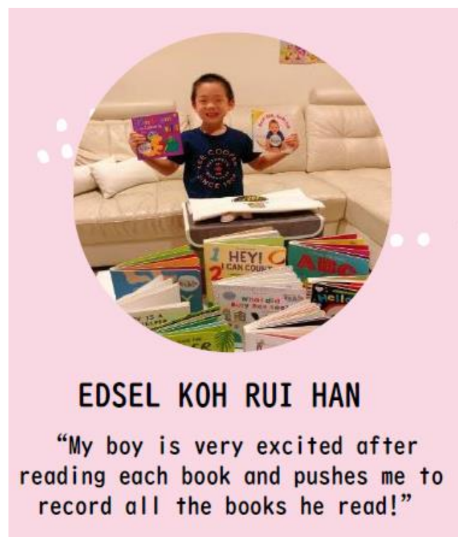
Some of the positive feedback from parents:

The programme is a great success where it garnered more than 6,000 participants resulting in close to 750,000 books borrowed from January 2020 to December 2021.