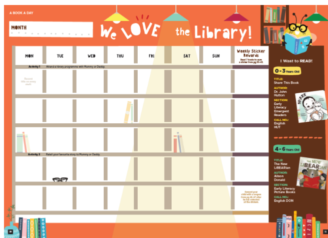
Thematic monthly calendar insert

ignite the joy of reading and create a meaningful parent-child bond through reading. Some suggested activities include singing nursery rhymes and retelling of stories to encourage pre-reading skills while having fun at the same time.