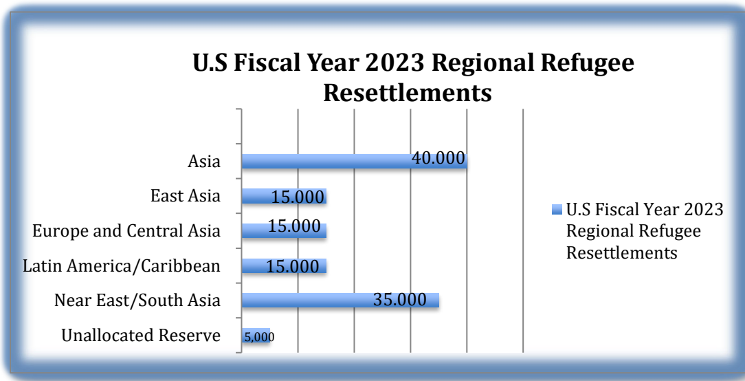
Figure 2. U.S Fiscal Year 2023 Regional Refugee Resettlements

Note: Global Region Resettlement numbers are shown in thousands.