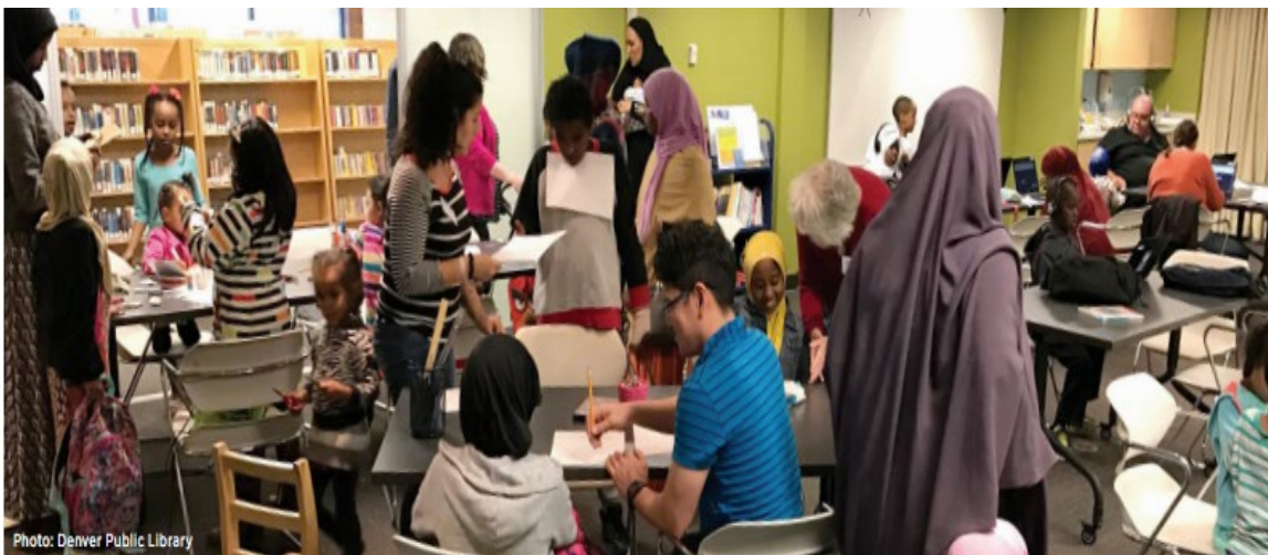
Figure 2. Denver Public Library: Photo Credit: Project Welcome (2016).

From an epistemological standpoint, it is crucial to note that libraries are confronting difficulties to provide wide-ranging services to refugees, several libraries are still searching for guidance to support refugee resettlement in order to better serve as well as understand refugees' needs (Project Welcome, 2016). Project Welcome 13 (2016) further noted that, through the organization, librarians are swiftly "learning from each other's best practices" (p.2). Additionally, Project Welcome (2016) specified that "libraries, collaborating with refugee resettlement agencies, ethnic library associations and refugee community members, can better serve and understand refugee needs," (p.1) especially on how libraries can "build committee connections" in order to preserve and promote refugee cultural heritage and contributions (p.3). Figure 2 depicted how libraries