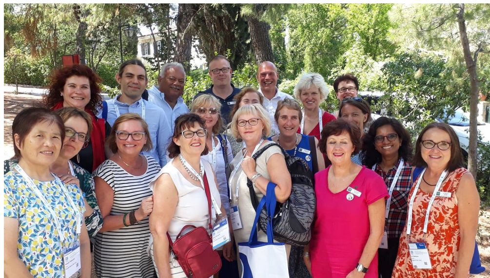
Outgoing and incoming members of the Public Libraries Standing Committee in Athens

August 2019 also marked the end of my term as Chair of the Public Libraries Standing Committee, and also my time with the Section. It has been an enormous privilege to be part of such a dynamic and committed group of individuals who collectively bring so much experience and professionalism to the table. To the outgoing and ongoing members my sincere thanks for your support; and to the incoming members the best of luck. Enjoy this wonderful opportunity.