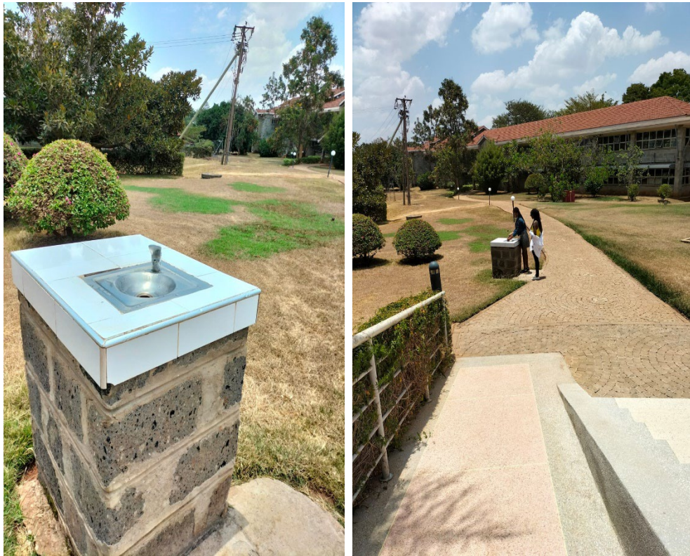
Figure 5: Automatic taps that produce water

They also have fixtures that automatically produce water using sensors (Figure 5).