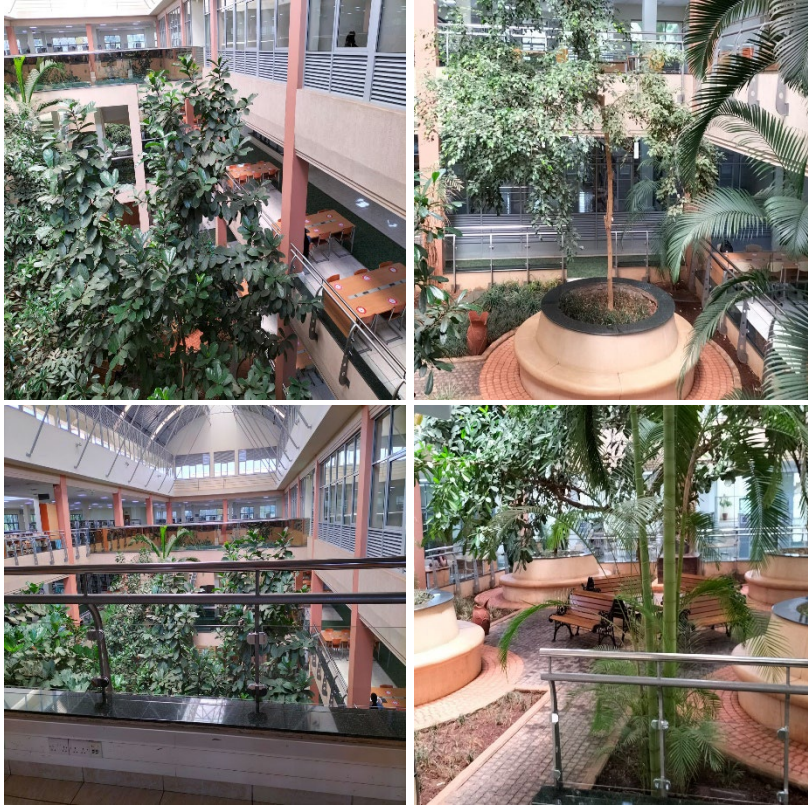
Figure 3: Tree Planting Inside the Library

b) Considerations for natural light: The building has big windows for natural lighting to