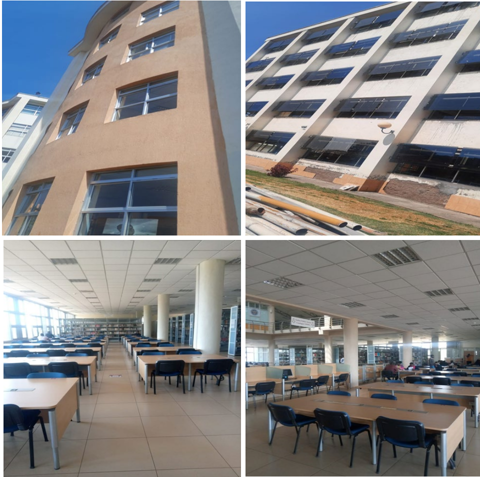
Figure 2: Use of Natural Lighting in Libraries

Regarding adopting greening aspects in libraries, different interviewees expressed what areas the greening is evident. These aspects include environmental elements that have to do with energy, harvesting of water, limited usage of resources, and the use of digital libraries.