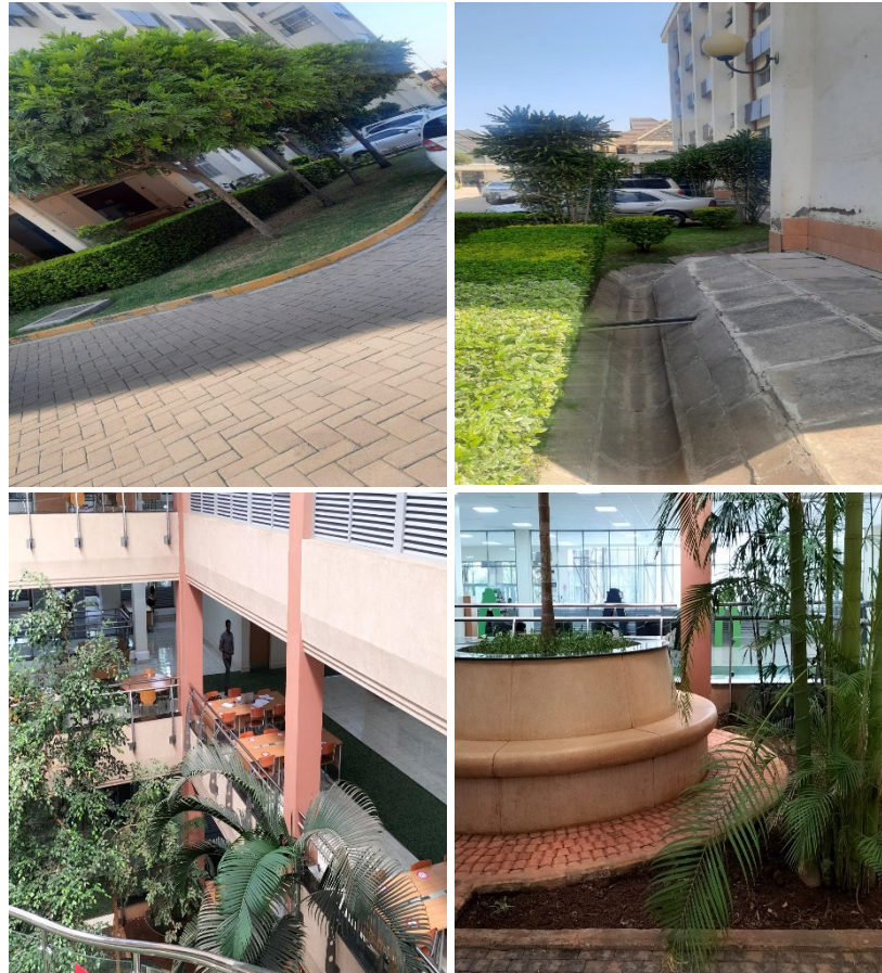
Figure 4: Planting trees