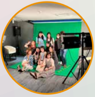
▲ INTERSTELLAR LIVE STUDIO