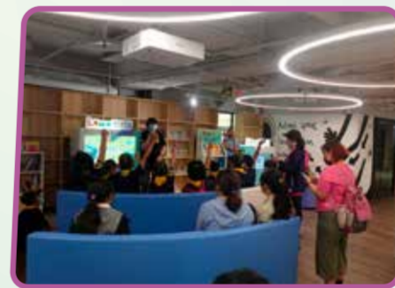
▲ LEARNING COMMONS