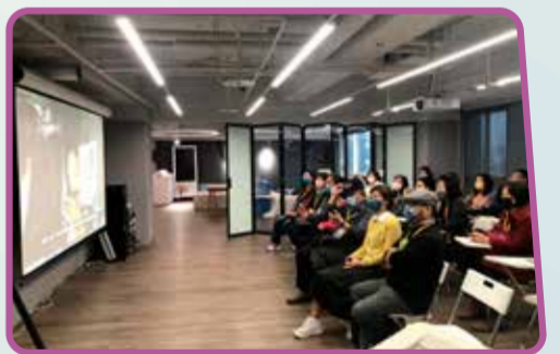
▲ MULTI-PURPOSE ROOM