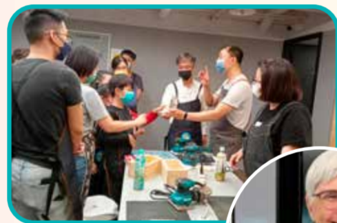
▲ CARPENTER STUDIO