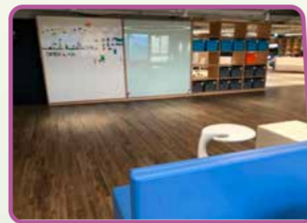
▲ EXHIBITION COMMONS

The key to enforce communication and sharing via Multifunction Room, Group Room, Learning Commons, and Exhibition Commons. Approach to getting on of exchange and mobilize seminars, lectures, or exhibitions we plan and schedule. The Multifunction Room is a great place for groups to screen video and work presentations. The group room is another choice for them to conduct group discussions and video conferences. The best is the learning common that a space suitable for holding lectures and exhibiting works, or a wonderful land for makers to communicate, stimulate creativity, share, and learn together.