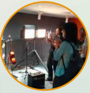
▲ MUSIC BOX