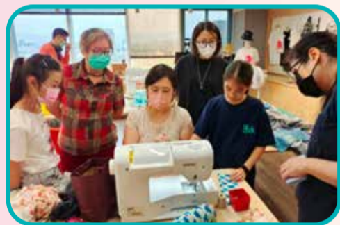
▲ DIY STUDIO

We foster the abilities, possibility, and potentiality of readers by joining our courses at IT Maker Area, Animation Creation, DIY Studio, Carpenter Studio, and Laser Machines Room. Paths to starting out of making to learn new skills and mine diverse services we provide, such as using 3D printing to produce nameplate, seal, and small doll, or sewing machines to make bags for themselves. Also, to crate animation using graphic creation software to get more colorful and fun of life.