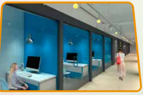
▲ PERSONAL/ FAMILY LIVE BROADCAST ROOM