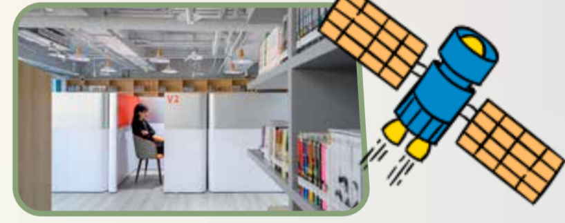
▲ INDIVIDUAL/ GROUP AUDIOVISUAL CARRELS