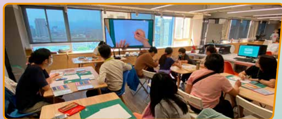
▲ ANIMATION CREATION AREA