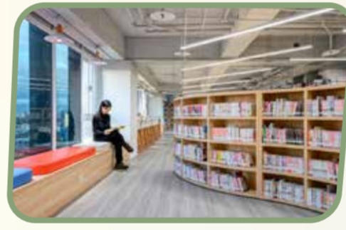
▲ LANGUAGE LEARNING AREA