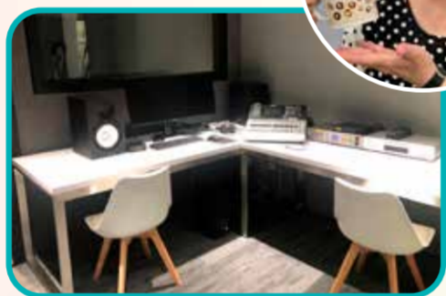
▲ MUSIC STUDIO