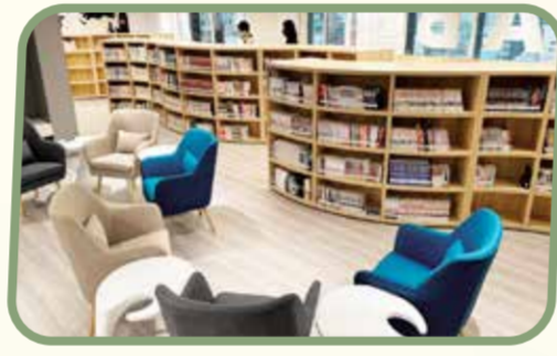
▲ COMIC BOOK AREA

published in the past one year, including English, Japanese, Korean, Indonesian, Thai, Vietnamese, Russian, German, French, Spanish, Italian, Arabic, etc. In total, collection of over 20,000 domestic and foreign comic books which are all limited to reading on site. Moreover, there are 5 individual audiovisual carrels and more than 7,000 audiovisual materials for listening and viewing.