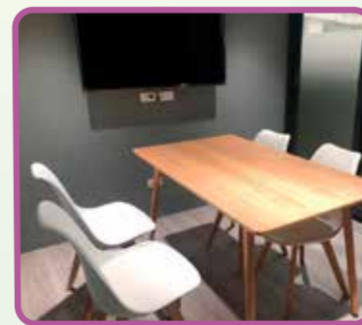
▲ GROUP DISCUSSION ROOM