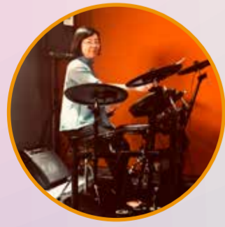
▲ REHEARSAL ROOM