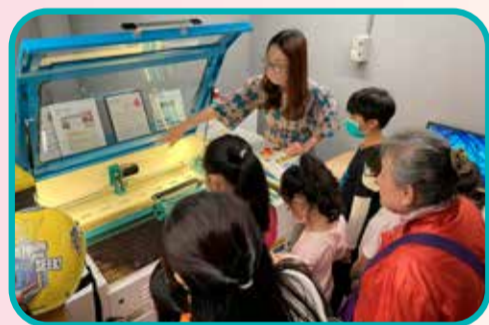
▲ LASER MACHINE ROOM