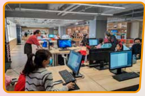
▲ IT MAKER AREA

Engage to inspire creative knowledge via Individual/Family Live Broadcast Room, Galaxy Live Studio, Rehearsal Room, and Music Studio for readers. Journey for making progress of programs to show themselves around the world and partner with us or peers they invent. Our readers use the equipment we provide for live broadcasts, recording, video editing, animation, image processing and post-production special effects editing, or use the best practice venue for student bands, with electronic drum set, audio equipment, etc. An amazing space and services for music and theatre rehearsals.