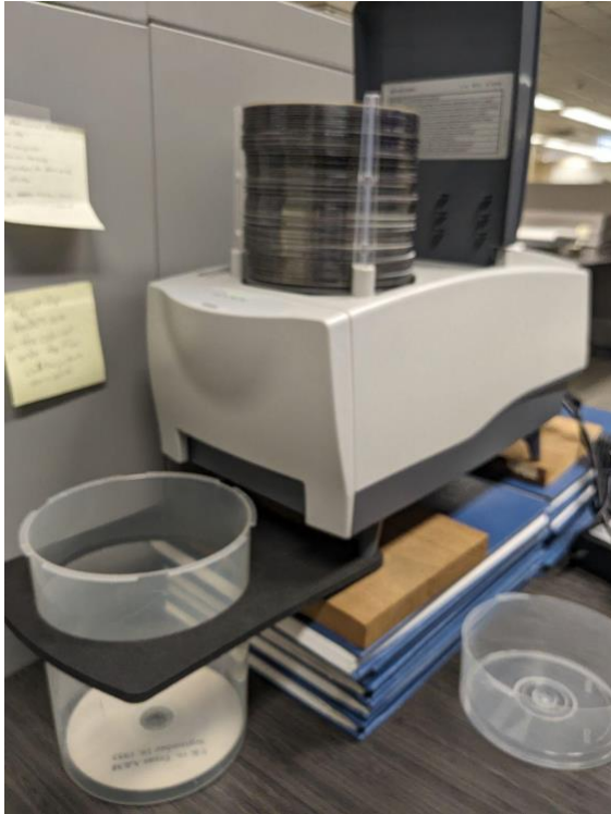
Figure 3: Acronova Nimbie with expansion rods, capable of handling 100 discs

Most of the La Voz discs arrived on spindles (a handful were in jewel cases) and prior to their donation to the Libraries they were stored in unknown conditions. Some of them were significantly scratched, showed signs of water damage, and for other less visible reasons failed to rip during the automated ingest. In most cases when this occurred, the Nimbie ejected the discs beneath the base of the machine to keep the failed discs separate from the successful rips, a valuable feature. In other instances, though, rather than ejecting the unsuccessful disc, the machine hung up in the middle of the automated rip process and continued to attempt to rip the same disc endlessly, requiring a manual restart of both the machine and the software. This process hang-up and restart extended the time necessary to transfer the materials, as did the manual transfer we attempted on individual failed discs using a single disk drive.