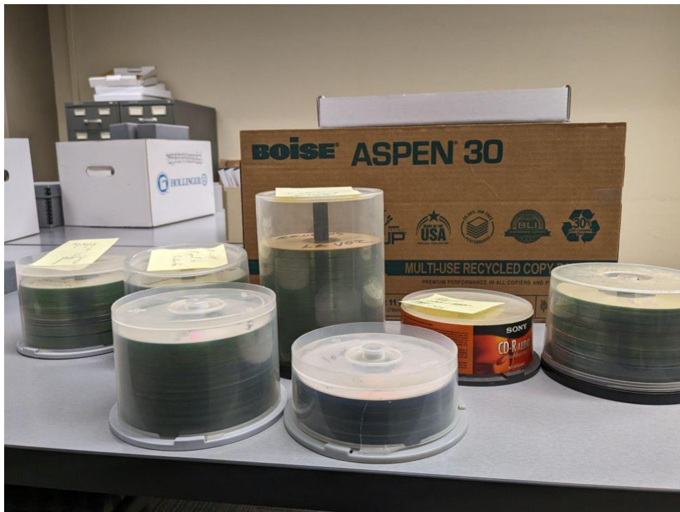
Figure 1: The La Voz optical media accession

In 2023, La Voz 's owner and former publisher donated the publication to the Kentucky Digital Newspaper Program in the form of a box of optical media, a combination of CD-Rs and DVD-Rs, containing born-digital copies of the publication from various years. While the SCRC had a small number of print issues of the publication, the record carton of discs promised to fill significant gaps in the collection (Fig. 1).