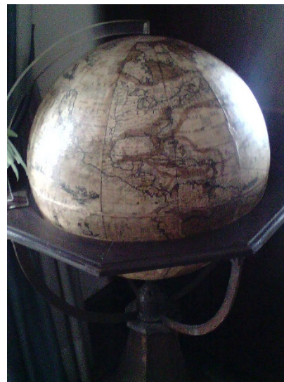
Universal subject access using DDC as connection point. Globe exhibited at the National library of Naples