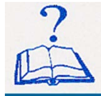
Symbol for dictionaries in libraries in Singapore.